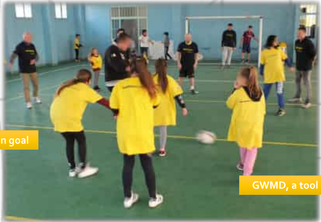
GWMD, a tool

If they are photographed, even from a distance, faces must be blurred with a software such as PhotoShop.