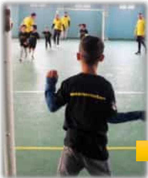
GWMD, a tool