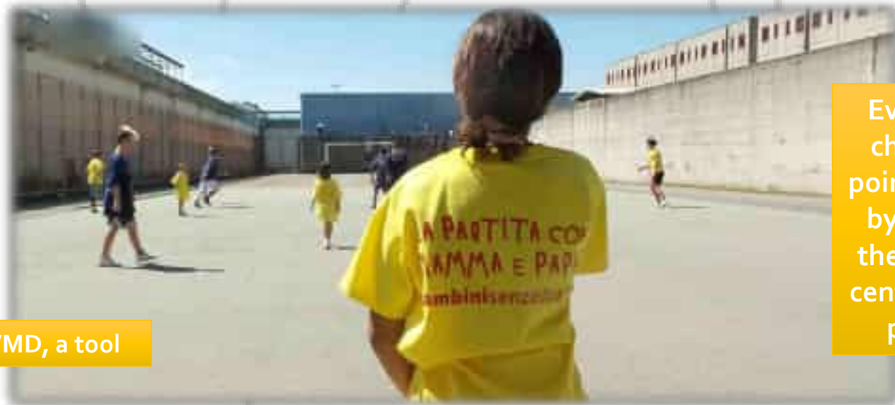
Evoke the children's point of view by placing them in the centre of the picture