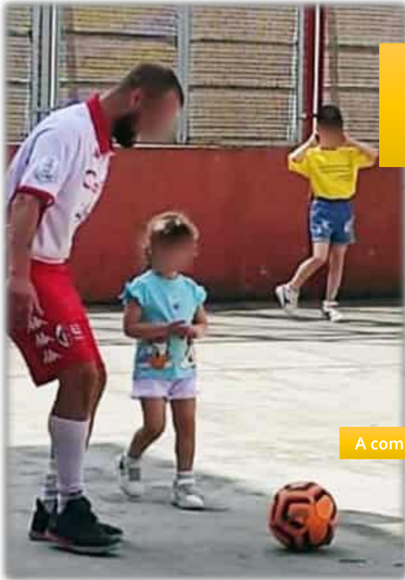
A common goal

If they are photographed, even from a distance, faces must be blurred with a software such as PhotoShop.