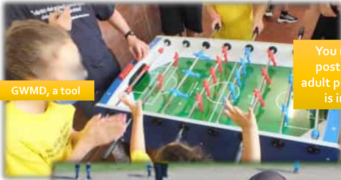
GWMD, a tool

You may not publish in any form (press, TV, web, posters and the like) the face and full figure of an adult person without their permission, except when it is in an open place (street, square, park, etc.).