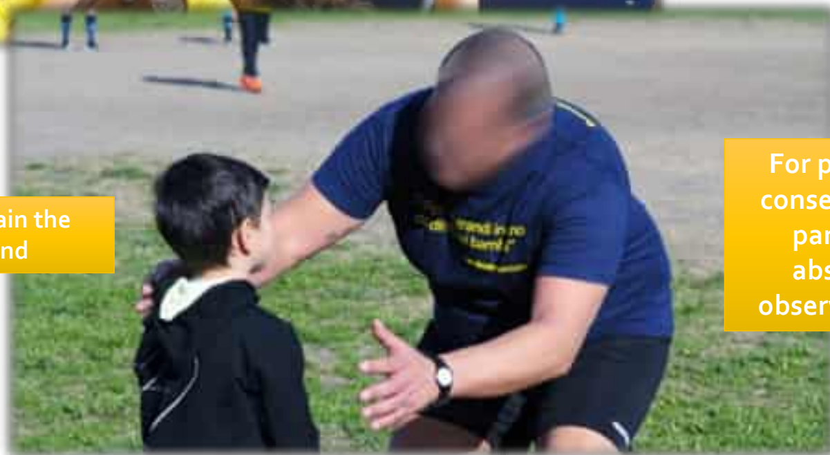
Maintain the bond

You may not publish in any form (press, TV, web, posters and the like) the face and full figure of an adult person without their permission, except when it is in an open place (street, square, park, etc.).